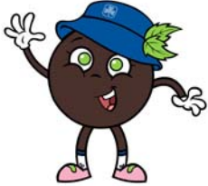
It's cookie time again!

We still encourage you to go door-to-door in your communities, making sure the girls have the proper supervision.