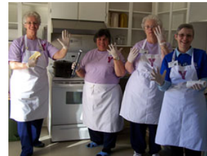
Y Knots lend a hand or two at Brownie Camp Academy