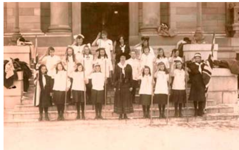
Girl Guides in front of Calgary City Hall in 1914